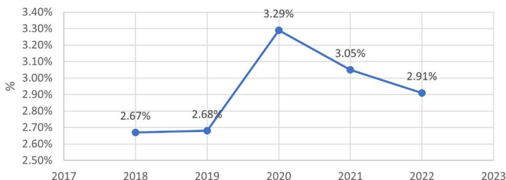
Figure 3. Public health spending as a percentage of GDP