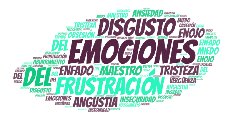
Figura 3. Nube de palabras de las principales emociones de los maestros identificadas durante las clases a distancia

In summary, it can be indicated that in the cases analyzed, the rigidity of the teachers in complying with what they consider essential (eg, turning on the camera during class), coupled with the lack of ability to self-regulate their reactions has generated emotions unfavorable for adequate educational development. In fact, and based on the classification proposed by Ekman and Lama (2016), it was identified that anger reached four subcategories in progressive levels of intensity: annoyance, frustration, exasperation and propensity to argue. Likewise, fear presented five subcategories in progressive levels of intensity: restlessness, nervousness, anxiety, fear and despair, while disgust presented three subcategories: discontent, aversion and dislike. Finally, sadness was the emotion with the most subcategories in the following progressive levels of intensity: disappointment, consternation, discouragement, resignation, helplessness, hopelessness, tribulation, anguish, discouragement and anguish (See figure 3). It is worth noting that emotions within the joy category were not studied in the present study.