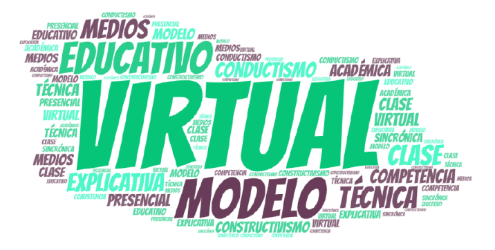
Figura 2. Nube de palabras del modelo educativo adaptado para el desarrollo de los contenidos de los programas educativos

Therefore, it is confirmed that the educational model of the upper and upper secondary levels that is operating is the result of vertiginous adjustments to guarantee the development of the different study programs through strategies that combine behaviorist, constructivist and connectivist elements (See figure 2).