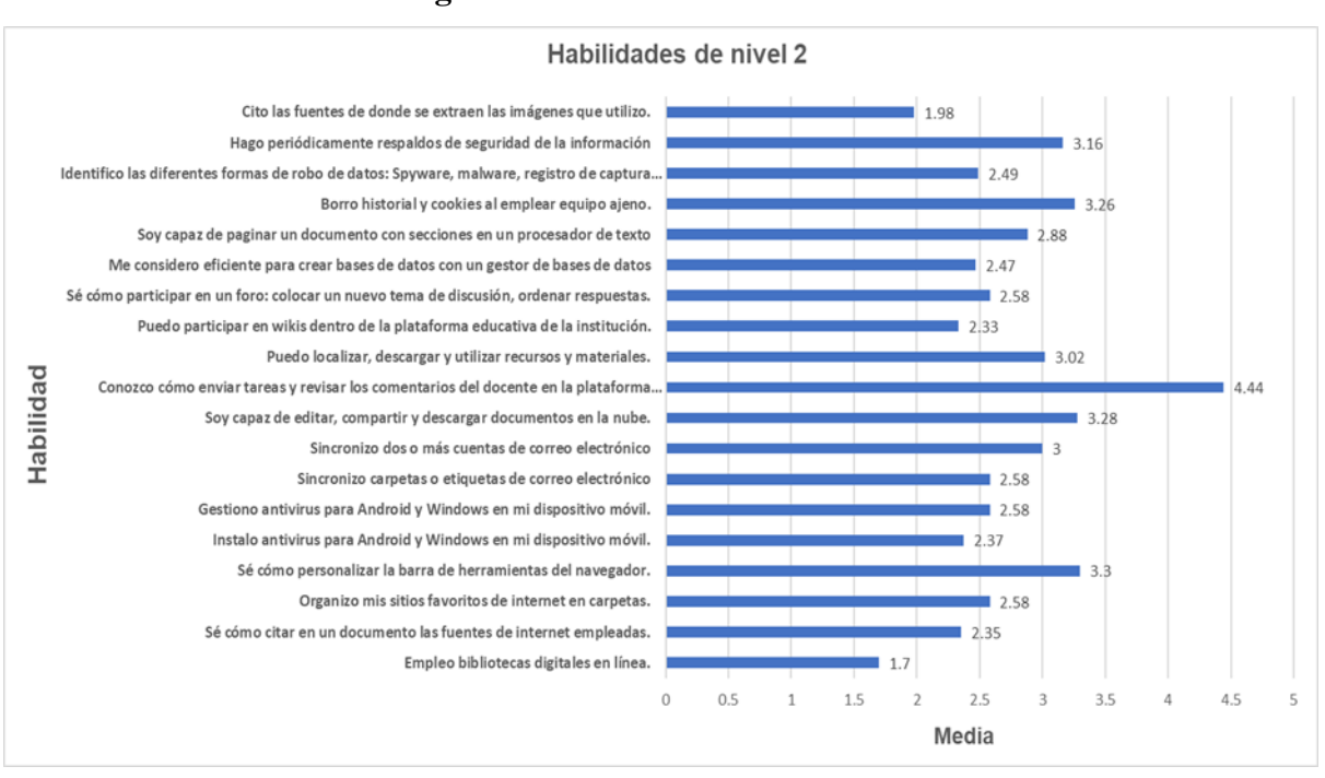
Figura 4. Habilidades de nivel dos

Figure 4 shows level two skills, which represent the knowledge that students acquire during their training journey. The average of the mean is 2.76. The highest scoring level two skills are knowledge of how to submit assignments and review teacher feedback on the platform and the ability to edit, share and download documents in the cloud.