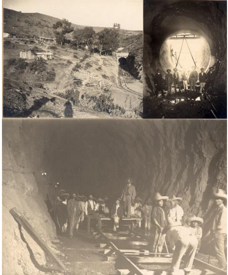
Figure 6. Construction of the Porfirio Díaz tunnel, commonly known as El Coajín