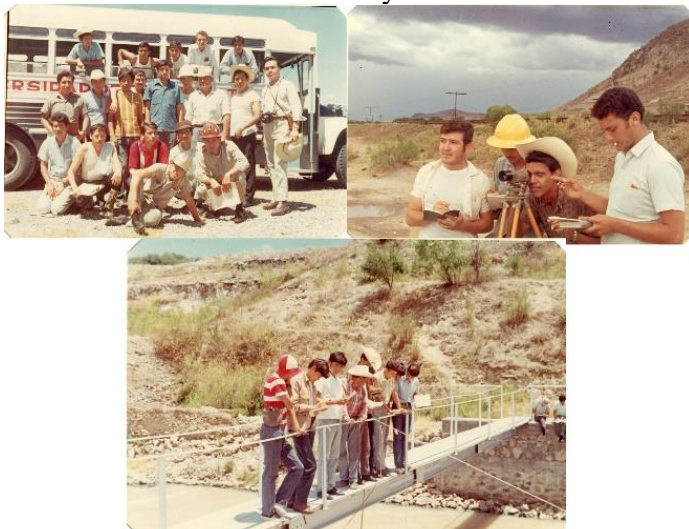
Figure 13. Internship activities for Topographical Engineering students in the 70s of the 20th century