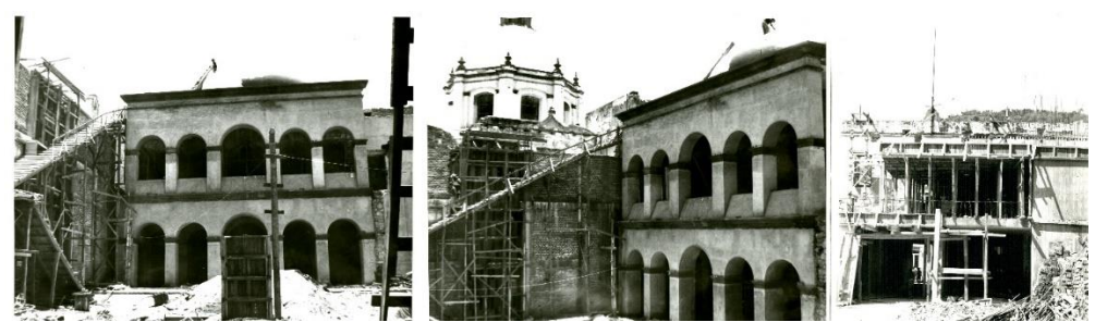
Figure 10. Refurbishment works in the ex-convent of Belén (current headquarters of Belén)