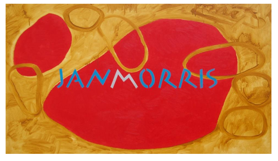
Figura 3. Pintura dedicada a Jan Morris. Serie Alfabeto de las Mujeres Maestras