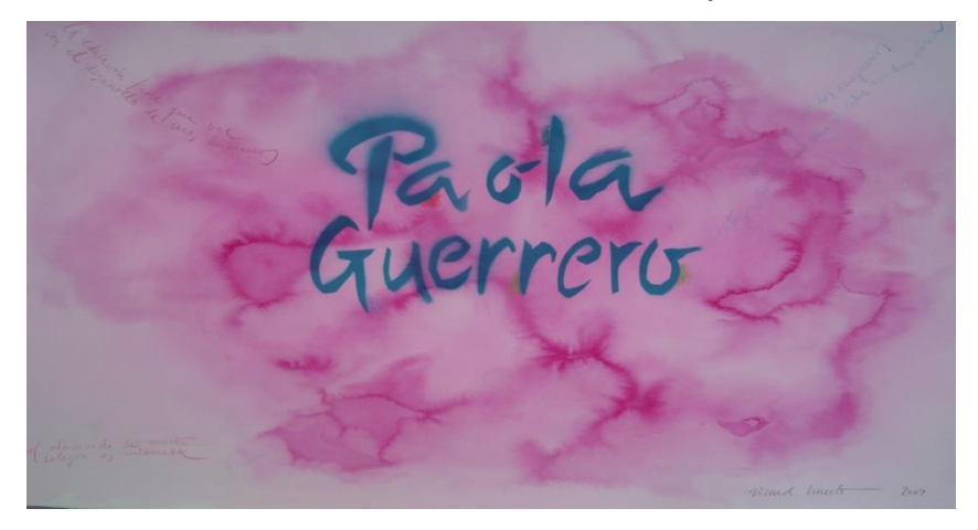
Figura 1. Pintura dedicada a Paola Guerrero. Serie Mujeres Maestras de Chile