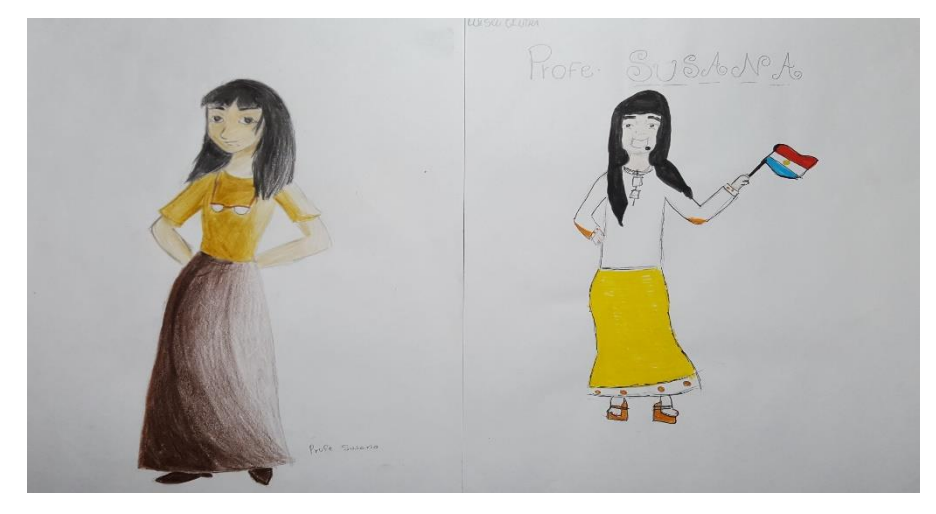
Figura 11. La maestra Susana Ortega interpretada por su alumnado