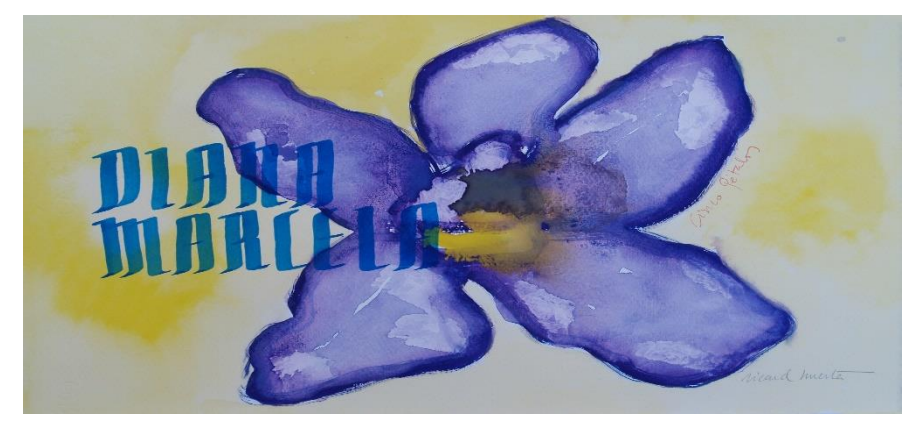
Figura 4. Pintura dedicada a Diana Marcela. Serie Mujeres Maestras de Colombia

a lot of involvement, and courage, especially in insecure environments and with vulnerable populations (Freire, 2015).